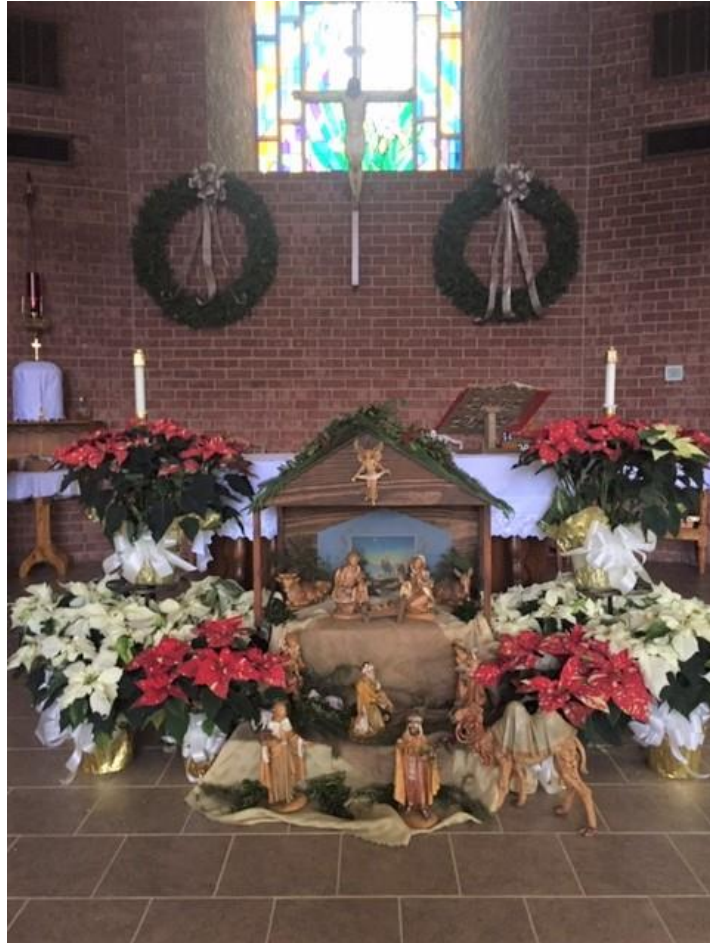
Thank you to all who made this Advent Season so special.

Sat. – Our Lady of Peace: 9:00 a.m. Mac's Kitchen followed by afternoon weddings,