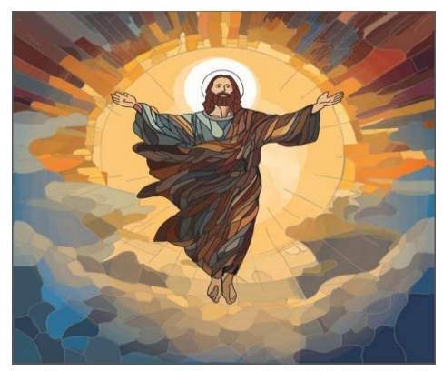
Ascension of the Lord

For those who are homebound or unable to attend, we offer Sunday Mass Online for St. Victoria and Our Lady of Peace www.olpcatholicchurch.org